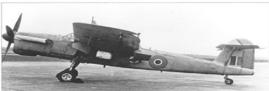
Barracuda MB.V (S879), which was ordered as a MB.II from Fairey but was converted on the production line to MB.V status in 1945. This aircraft represented another interim stage in the development of the final MB.V shape, as it had the new wings, and tailplane of increased incidence but the standard MB.II/III fin and rudder shape.